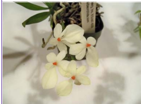
Aerangis [Aergs.] luteoalba var. rhodosticta, Trudy Bliesath, Bronze (401)