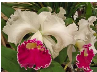
Dendrochilum [Ddc.] glumaceum , Edith McGrath, Bronze Fragrance, (103)