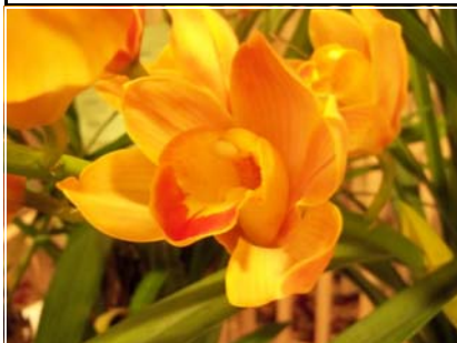
Cymbidium [Cym.] Unknown , Edith McGrath, Bronze (101)