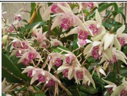
Dendrobium [Den.] kingianum 'Candice' Raymond Kwong, GOLD (201)